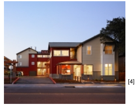
Property Jack Capon Villa [4] 2216 Lincoln Avenue