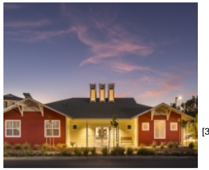
Property Valley View Senior Homes [3]